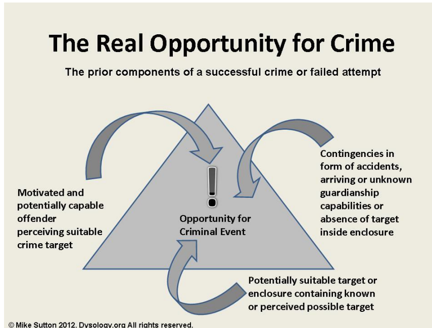
Figure 3: A More Realistic Depiction of just some Pre-crime Cognitive Processes, Uncertainties and Contingencies.

offenders perceive potential targets all the time in what they perceive to be absence of capable guardianship, but they do not always act on that, they can choose not to because they choose to have other things to do. On the other hand, if put together under the right conditions the atoms of chemical elements such as hydrogen and oxygen, which have no brains and therefore no free will, will combine to form water. Humans, however, are not simple chemical elements and crimes are not chemical compounds. Chemistry is a bad analogy to explain the various complex causes of crimes.