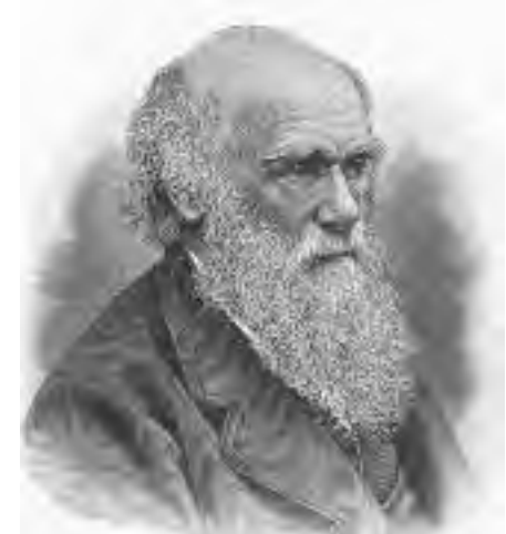
B Charles Darwin