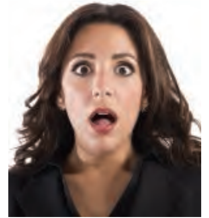
A Does this expression help to ensure our survival?

Not all human behaviours obviously help humans to survive or reproduce. This may also be the case with some non-verbal behaviours, such as the use of gestures.