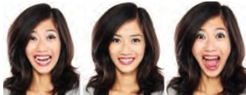
C Are facial expressions like these recognised by everyone?