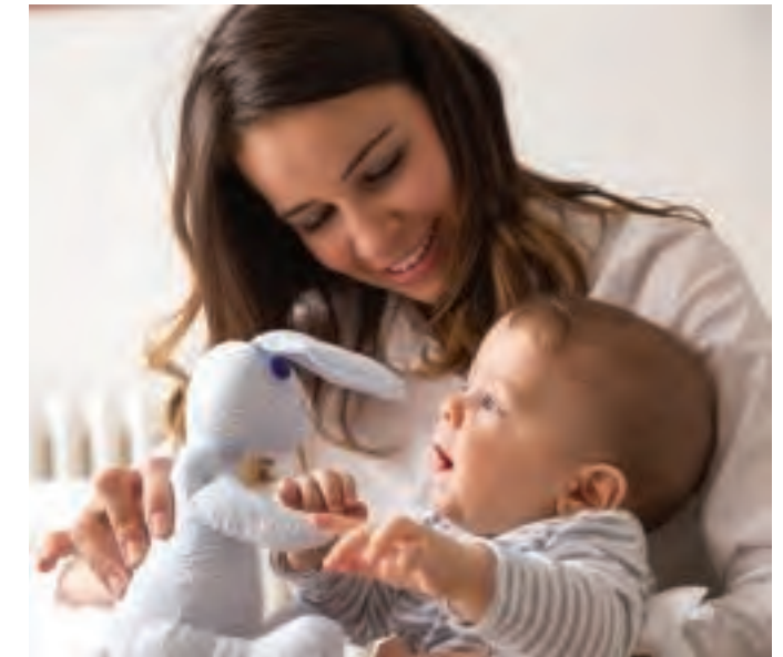
D Is the ability to use non-verbal behaviour something we are born with or something we learn?

Researchers used 4800 photographs of sighted and blind athletes to compare the facial expressions they made at significant moments. They found that both the sighted and the blind athletes expressed their emotions in similar ways. For example, 85 per cent of silver medallists produced social smiles during the medal ceremony. A true smile causes the eyes to narrow and the cheeks to rise, but a social smile only uses the mouth muscles. This suggests that the silver medallists were not truly happy to come second and they had learned to give a social smile in this situation.