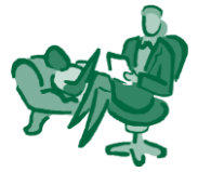
Table 1: Approaches in the psychological model